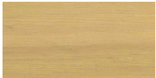
CHIT CHAT BEECH