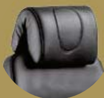
ACS Executive Headrest