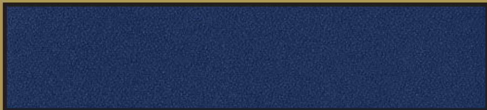
Costa Blue Cloth