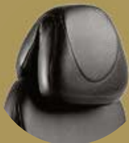
Aztec Headrest (Leather Only)