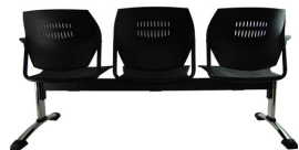
Tia Beam Seating - Black Rear View