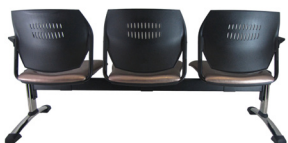
Tia Beam Seating Upholstered Rear View