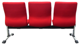
Ava Beam Seating Rear View