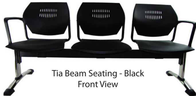
Tia Beam Seating - Black Front View