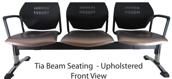
Tia Beam Seating - Upholstered Front View